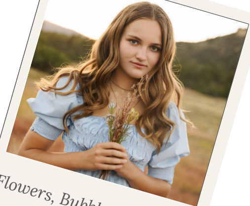
Flowers, Bubbles, Balloons