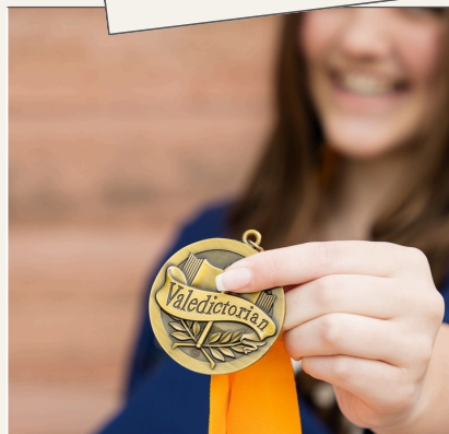
Awards, Trophies, Medals