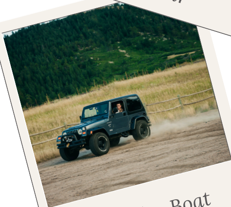
Car, Bike, Boat